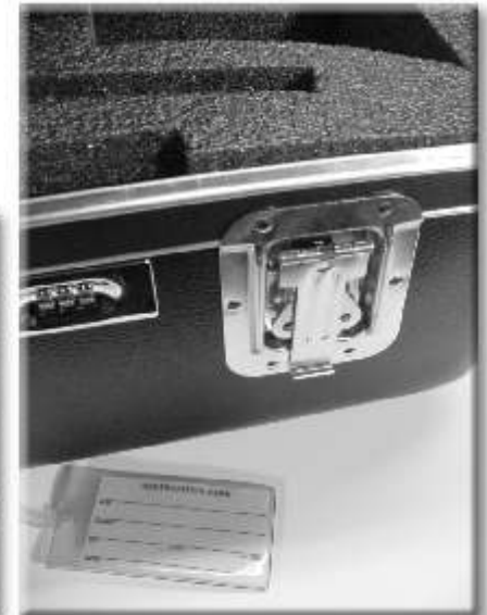
Color coded luggage tags for ease of identification of case octave

Port-A-Bell® cases are indeed a worthwhile investment!