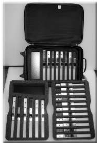
Suzuki Chimette Case

Whether you are traveling across the hall or across the country, you'll find Port-a-Bell® to be a better case. The ease at which they travel adds comfort to the bell experience.